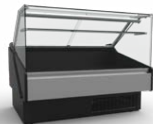
Optional FG Flat Glass