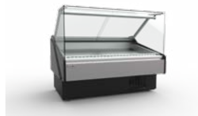
Optional SF Flat glass