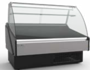
Standard CG Curved Glass