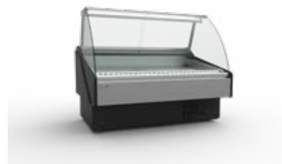
Standard SC Curved Glass

KFM-SC-120-S KFM-SC-120-R $29 410 $26 230