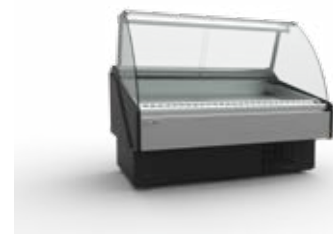
Standard SC Curved Glass

KFM-SC-120-S KFM-SC-120-R $24 980 $22 280