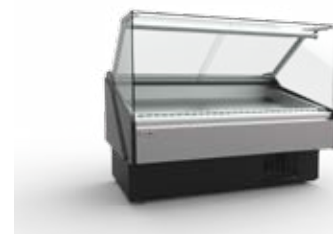
Optional SF Flat glass