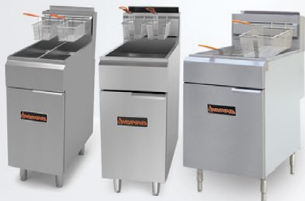
SRF-25/25 SRF-40/50 SRF-75/80