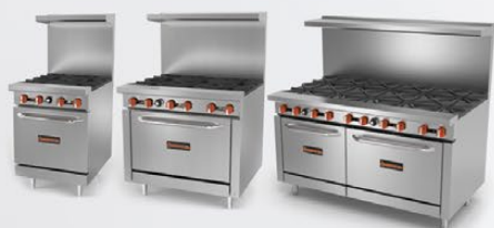
SR-4-24 SR-6-36 SR-10-60

Full unit replacement. See conditions on back.