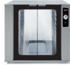
AX-PR8 SHIP WT: 233 lbs