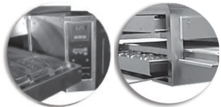
Removable panels for easy cleaning