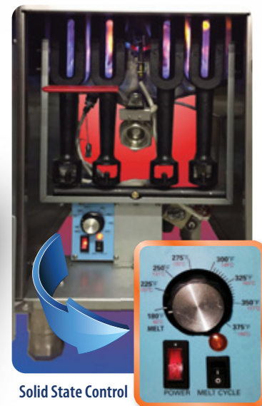
Solid State Control