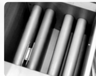
Fully peened tank ensures easy cleaning