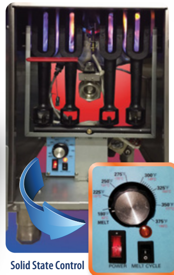
Solid State Control